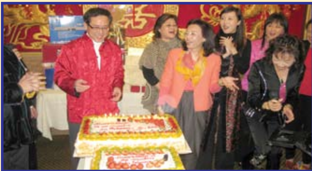
So many things to celebrate – Year of the Tiger, birthdays, new board members.....