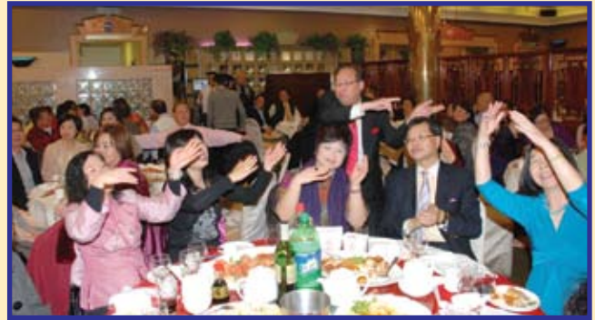
What a great party!