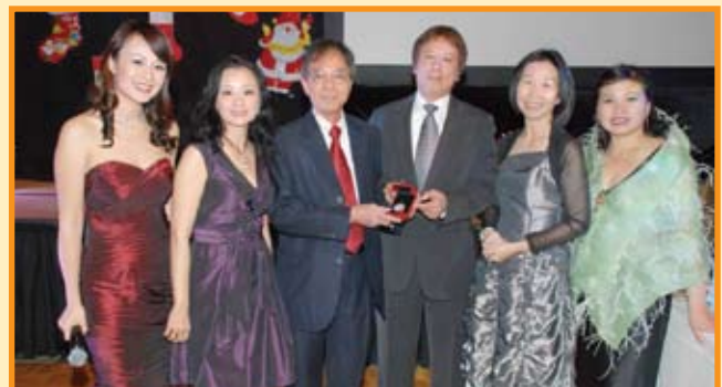
Winner of the charity raffle grand prize, congratulations!