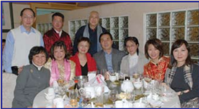
Thank you, La Salle College Old Boys Association, for supporting us