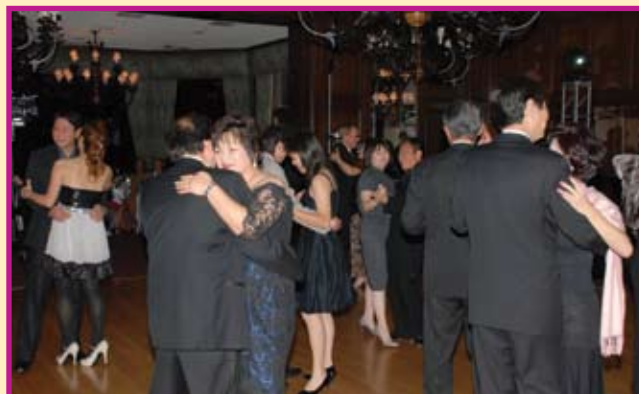
Guests having a great time