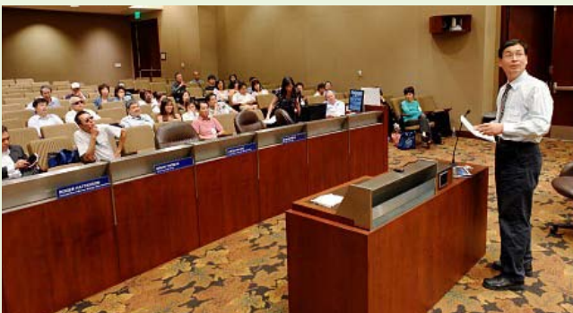
The audience literally refused to let the Feng Shui master go!