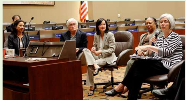
Panel discussion on different water issues