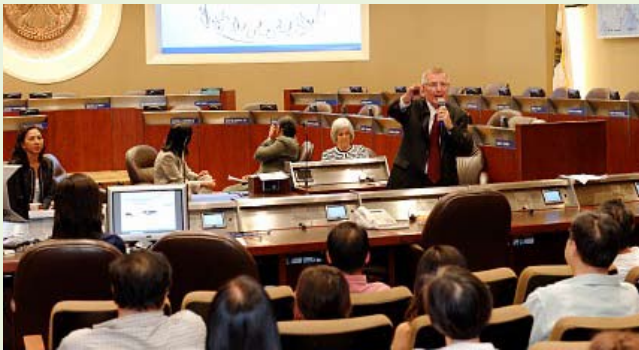
There is so much to know and learn

The topics ranged from water supply issues in California, climate change and water and energy nexus to the role of water in the theory and practice of Feng Shui as well as a slide show on the beauty of water at the beautiful board room of the Metropolitan Water District. The “Water Summit” offered a very informative and interesting session on different aspects of “water”. The program ended with a light lunch buffet, and all these for a $5 registration fee! Watch out for more great events like this.