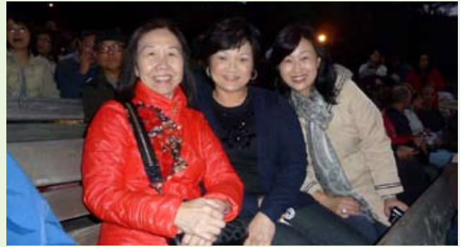
Bundled up for the night