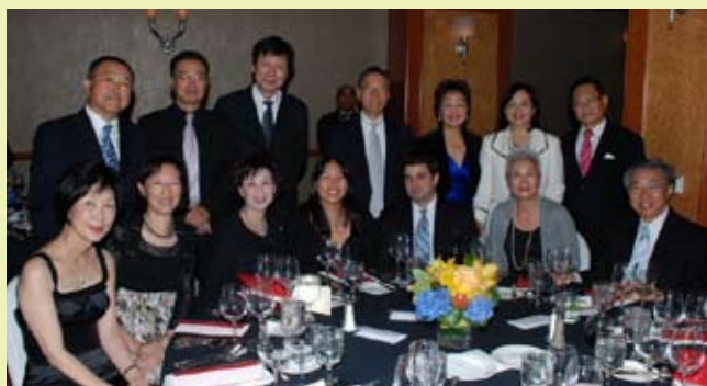
These donors support us over the years