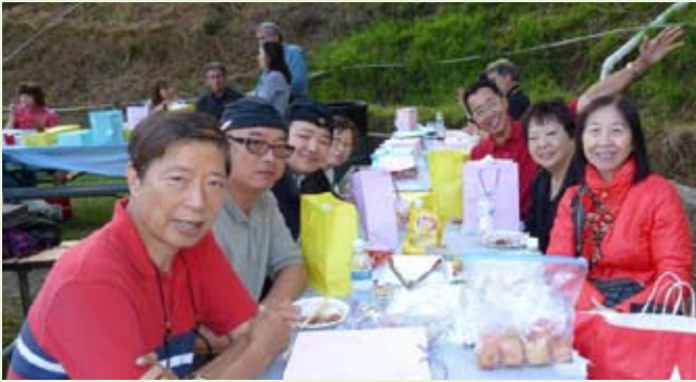
Having a great time

This joined event with Hong Kong Association of S. Cal. proves to be very popular every year and is always sold-out. If you missed it this year, please remember to reserve your tickets early next year.