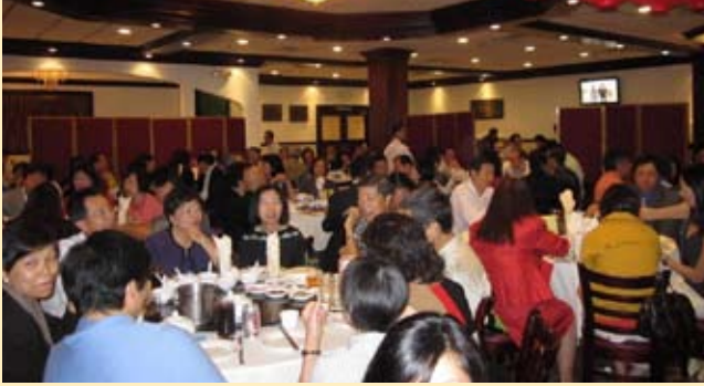
2010 Mid Autumn Festival Dinner is back this year. Let the fun begin.

After a break last year, the Mid-autumn Festival Dinner returned this year. Again, the evening was full of fun. The ever popular lantern puzzles added much festivity, and the raffle draw with a gold tiger as grand prize was a big draw. Last but not the least, the karaoke was unstoppable!