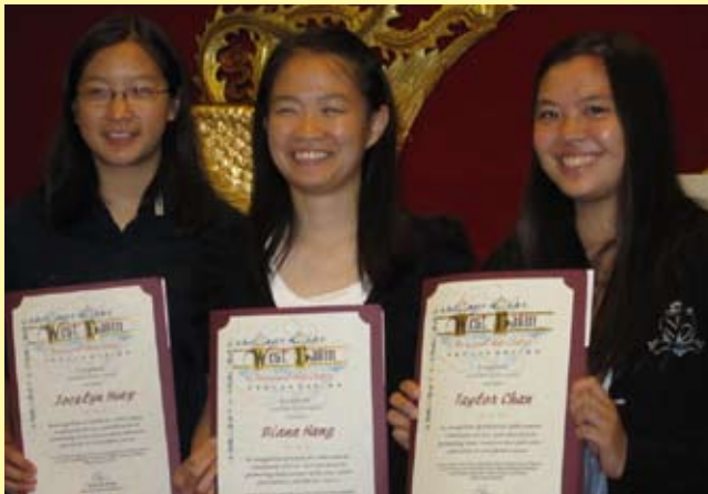
Congratulations to the Essay Contest winners